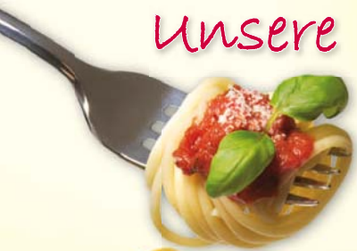
3 Bandnudeln 4 mm gewalzt oder gepresst (Tagliatelle)